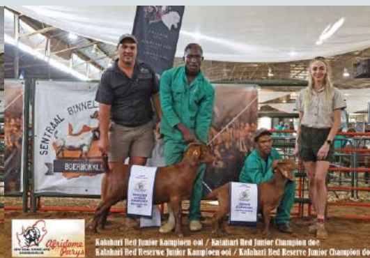
Kalahari Red Junior Kampioen ooi / Kalahari Red Junior Champion doe Kalahari Red Reserve Junior Kampioen ooi / Kalahari Red Reserve Junior Champion doe