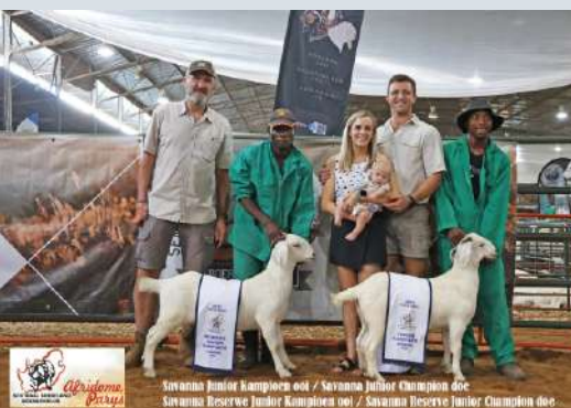
Savanna Junior Kampioen ooi / Savanna Junior Champion doe Savanna Reserve Junior Kampioen ooi / Savanna Reserve Junior Champion doe

Boer goat Reserve Junior Champion Ewe - Karsten Boerbok Stud