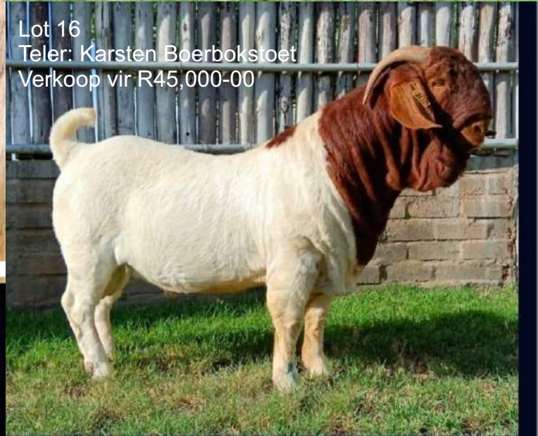
Lot 16 Teler: Karsten Boerbokstoet Verkoop vir R45,000-00

FOR MORE INFORMATION VISIT ANDRÉ KOCK & SON LIVESTOCK AUCTIONNEER/ESTATE AGENT FACEBOOK PAGE.