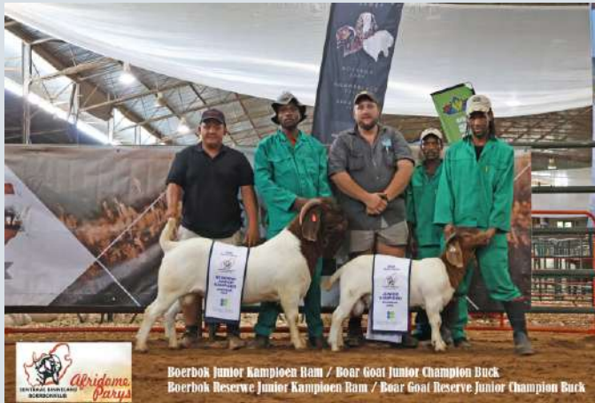
Boerbok Junior Kampioen Ram / Boer Goat Junior Champion Buck Boerbok Reserve Junior Kampioen Ram / Boer Goat Reserve Junior Champion Buck

Kalahari Red Reserve Junior Champion Ram - Salmon van Huyssteen