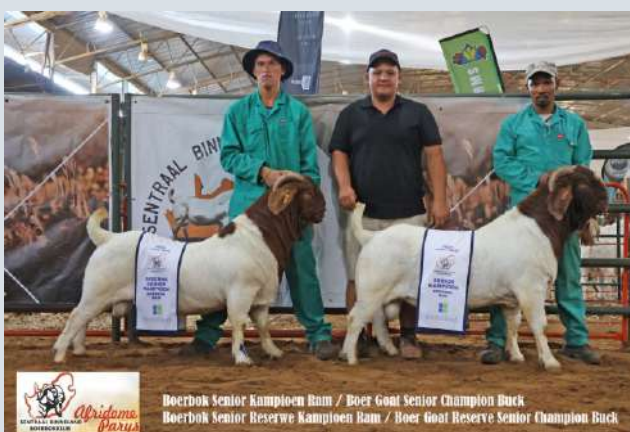
Boerbok Senior Kampioen Ram / Boer Goat Senior Champion Buck Boerbok Senior Reserve Kampioen Ram / Boer Goat Reserve Senior Champion Buck

Kalahari Red Reserve Senior Champion Ram - Dhidejak Kalahari Reds