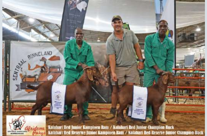
Kalahari Red Junior Kampioen Ram / Kalahari Red Junior Champion Buck Kalahari Red Reserve Junior Kampioen Ram / Kalahari Red Reserve Junior Champion Buck