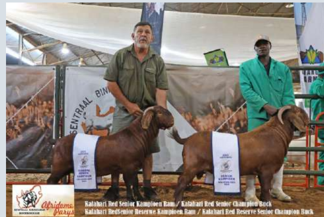
Kalahari Red Senior Kampioen Ram / Kalahari Red Senior Champion Buck Kalahari Red Senior Reserve Kampioen Ram / Kalahari Red Reserve Senior Champion Buck