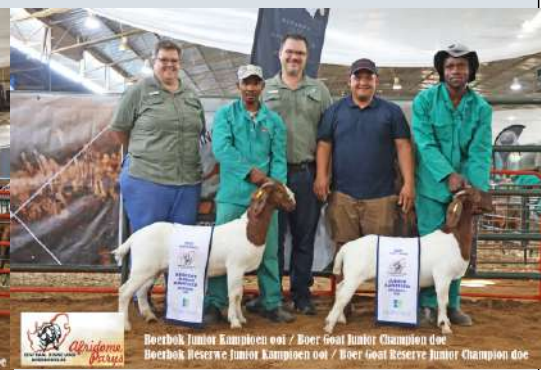
Boerbok Junior Kampioen ooi / Boer Goat Junior Champion doe Boerbok Reserve Junior Kampioen ooi / Boer Goat Reserve Junior Champion doe

Boer Goat Senior Champion Ram - Karsten Boer Goat Stud