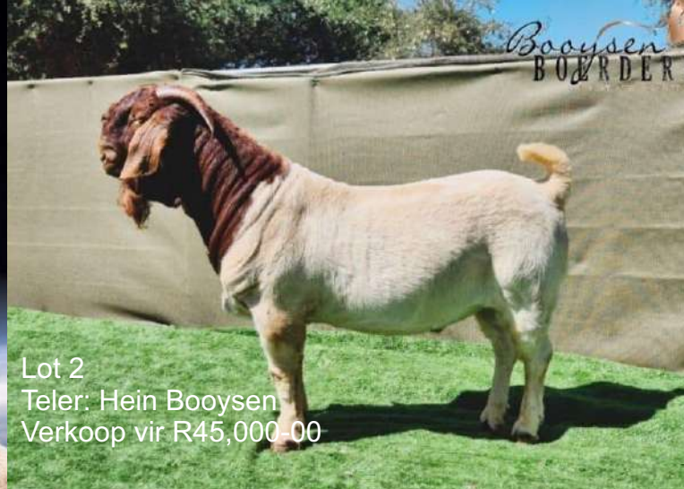
Lot 2 Teler: Hein Booysen Verkoop vir R45,000-00